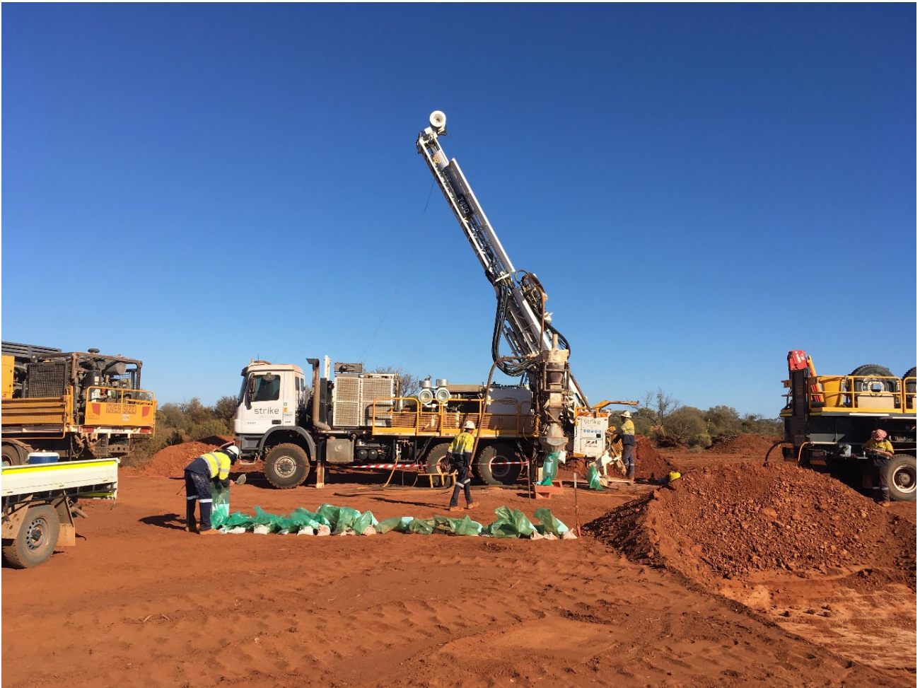
Photo 1: RC drilling rig at Coogee Gold Project for Victory's second drill programme